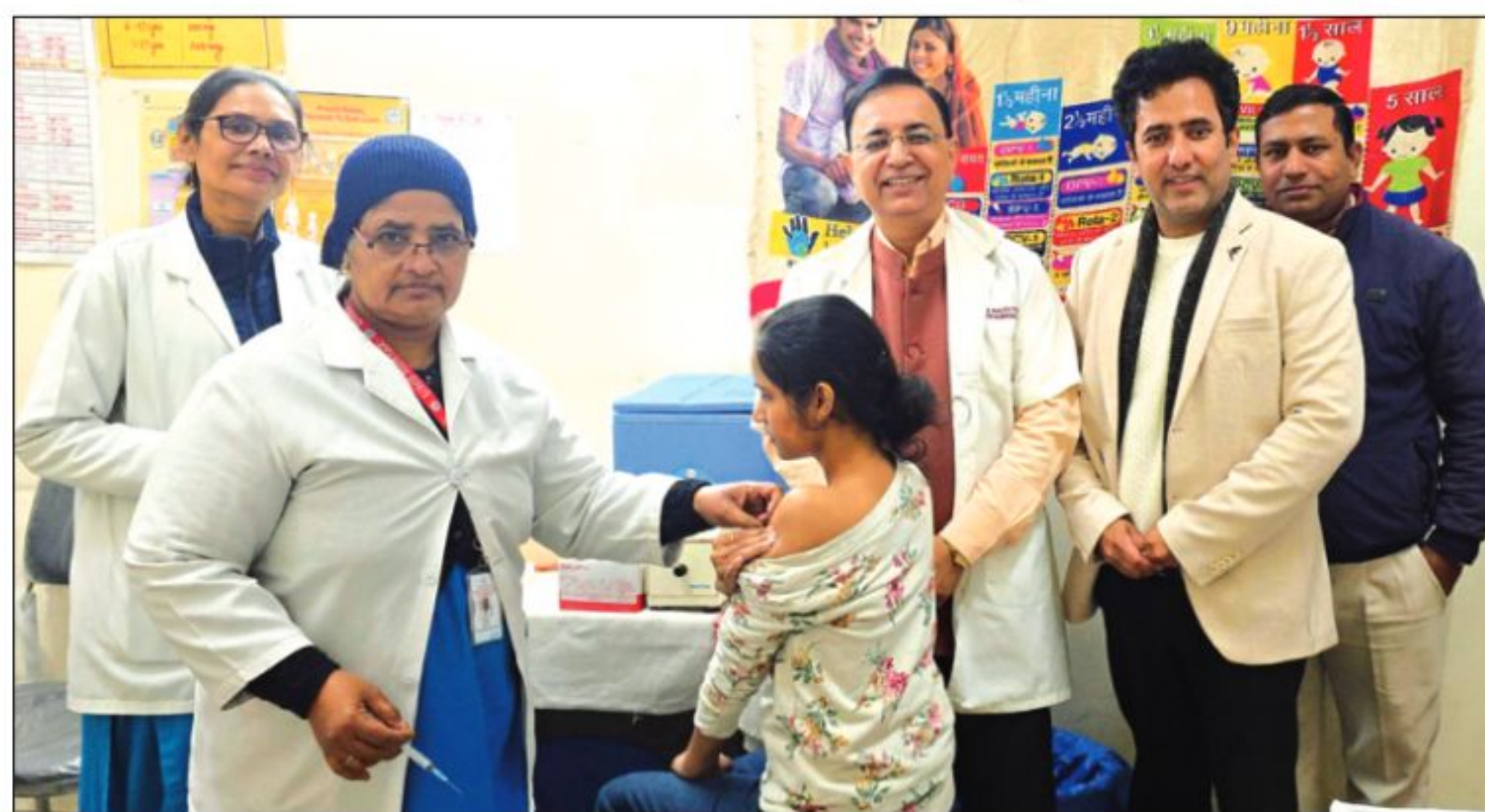
Hepatitis B vaccination Centre launched in Immunization Clinic PGIMS for HCV, High Risk Groups & Health Care Workers on 10th January under Jeevan Rekha project