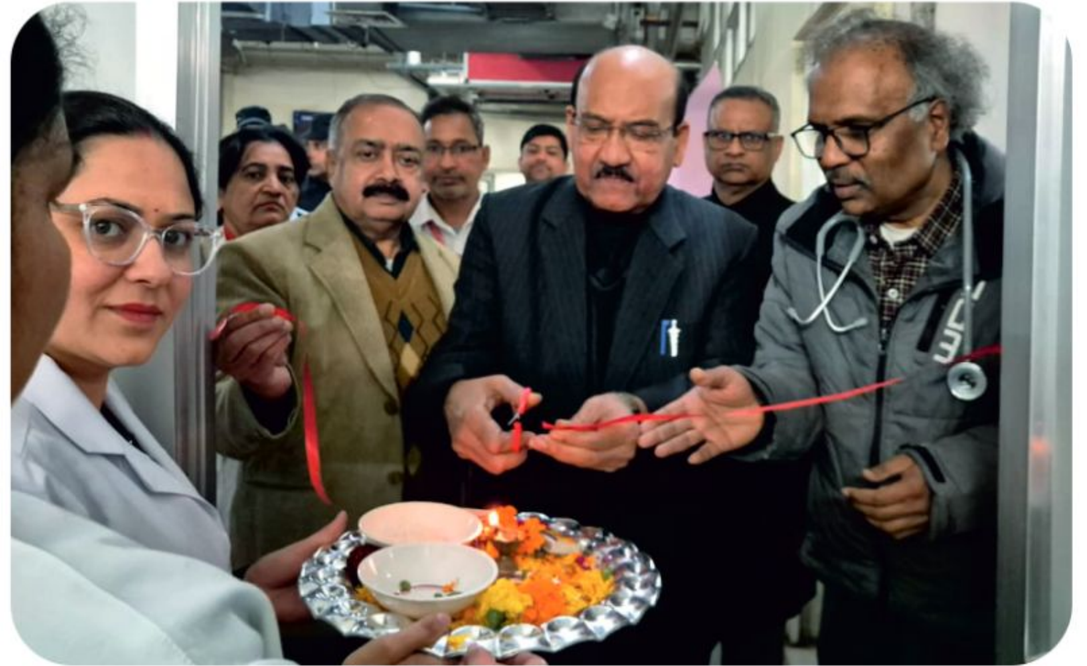
Dual Launch of Breast feeding Room and NRC on 16th January, 2026