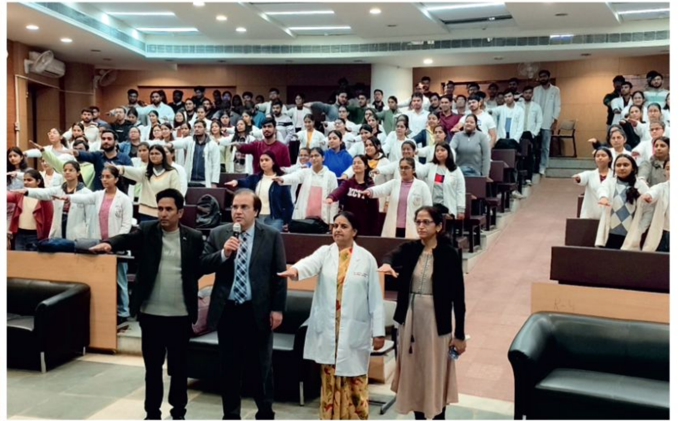
National Voters' Day (25th January) It was observed in UHSR on 24th, January, Saturday. Students across various departments were administered an oath to exercise their voting rights and awareness created