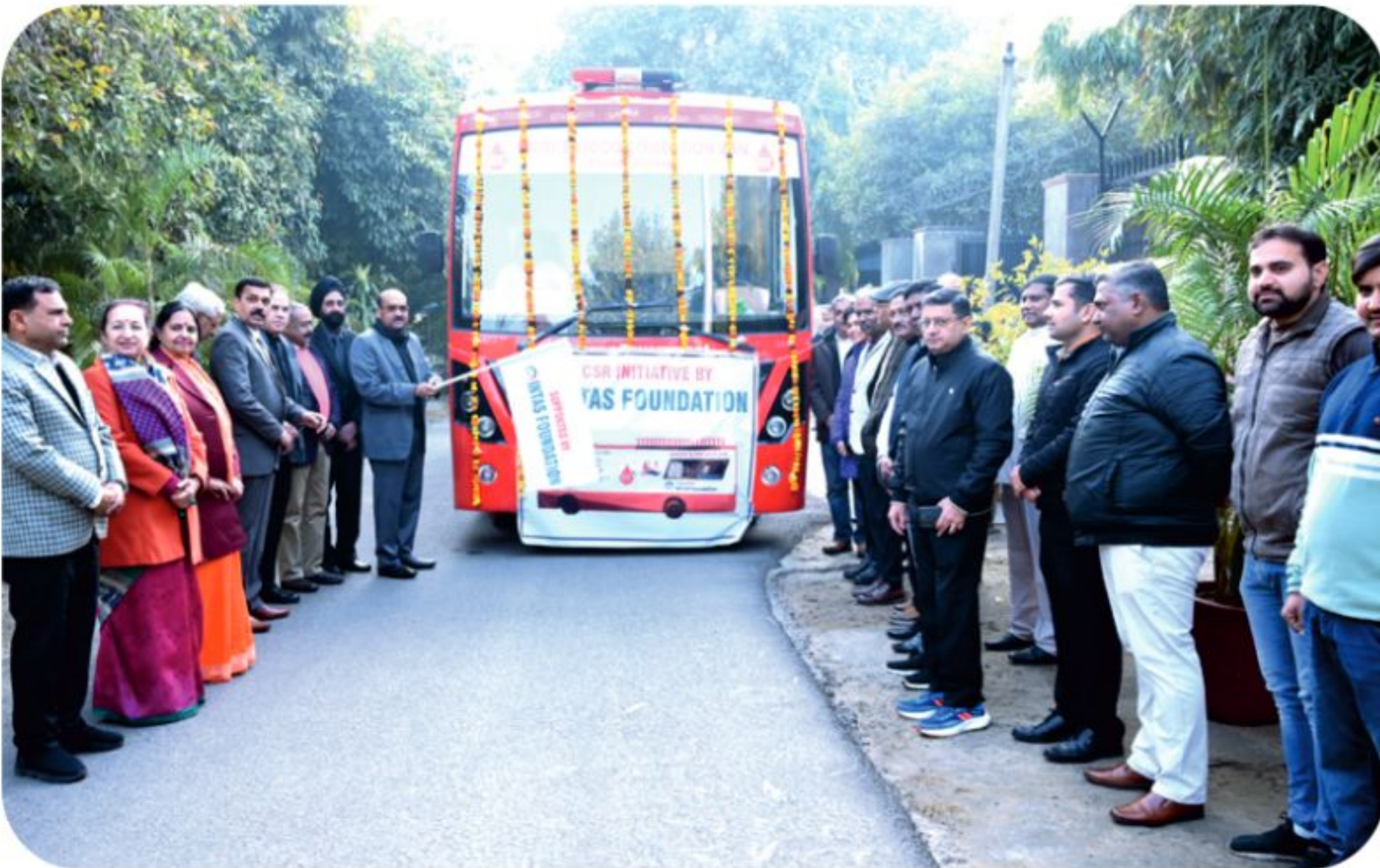
Launch of Mobile Blood Donation Van on 26th January, 2026