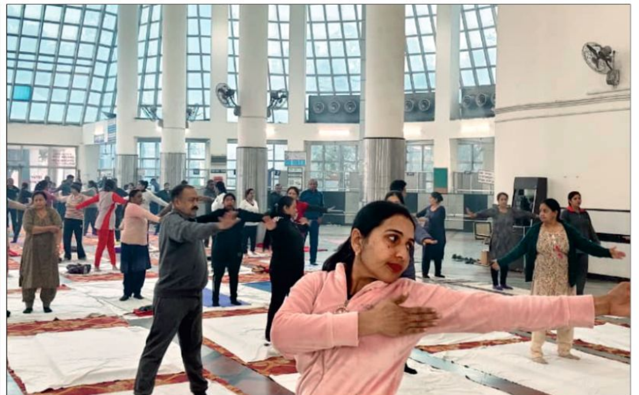
Sun Salutation Day Celebration (10th February, 2026) UHS Rohtak organized Surya Namaskar Programme to Promote Wellness. The event saw active participation from doctors, staff, and students.