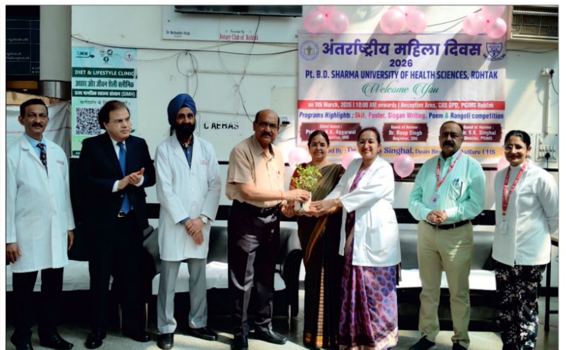
International Women's Day (8th March) programme held by UHSR, Addressing the gathering the Hon'ble V.C. emphasized that women empowerment is fundamental to the holistic development of society, as women form its backbone.