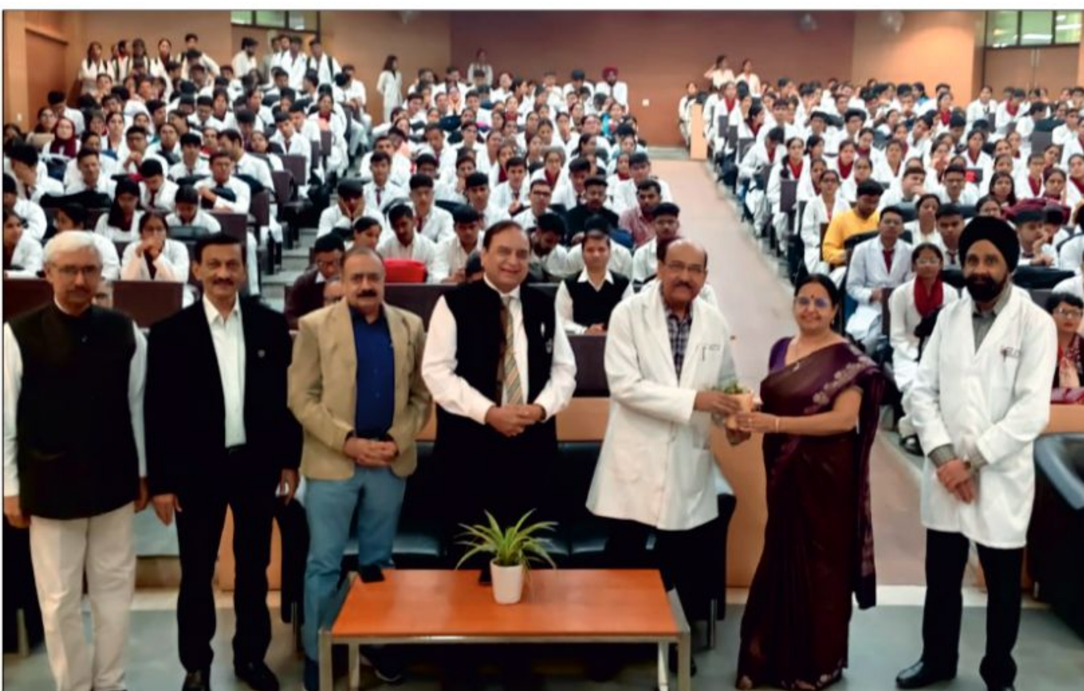
Stress Management Day (13th February, 2026) Art of Living Workshop A stress management programme was organized at UHSR, in collaboration with Art of Living.