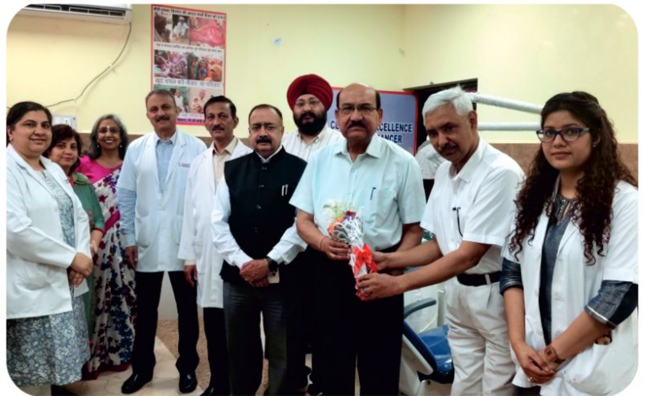
Early Detection, Better Care : Oral Cancer Clinic Inaugurated at PGIDS on 16th March, 2026