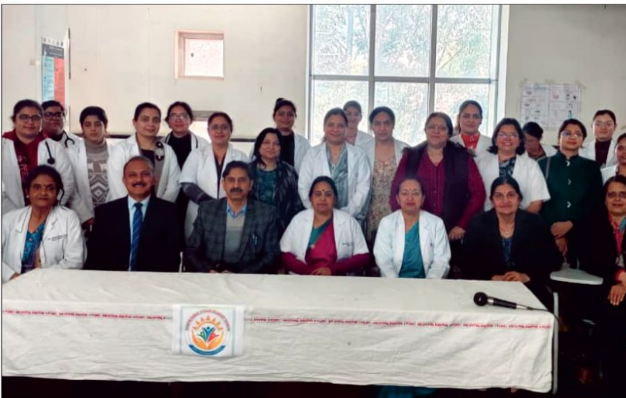
World Cancer Day (4th February) Cancer awareness program was organised at the Gynae OPD to highlight vaccination screening and early detection of various cancers Including cervical cancer and key preventive measures