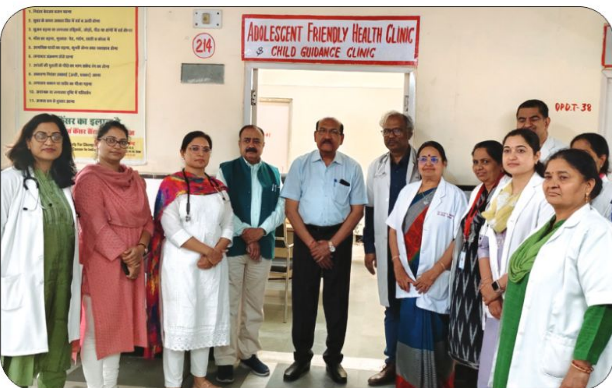
Adolescent friendly Health Clinic inaugurated in Pediatrics OPD on 17th March, 2026