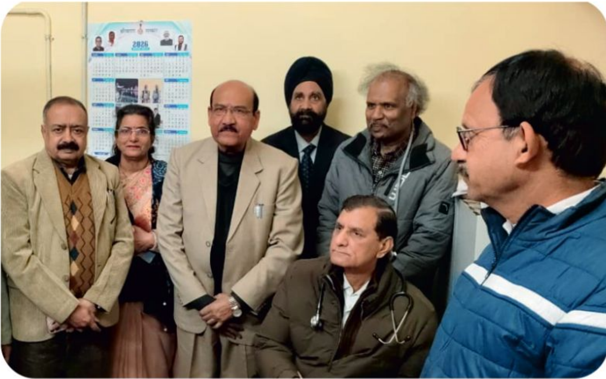
Homeopathy OPD Launched at PGIMS on 15th January, 2026