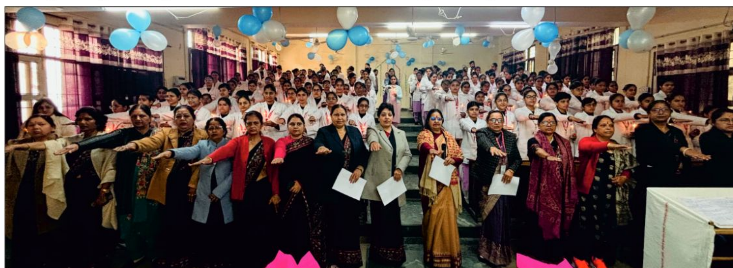
Florence Nightingale Oath Ceremony held on 30th January, 2026, marks the beginning of professional journey of Nursing Students.