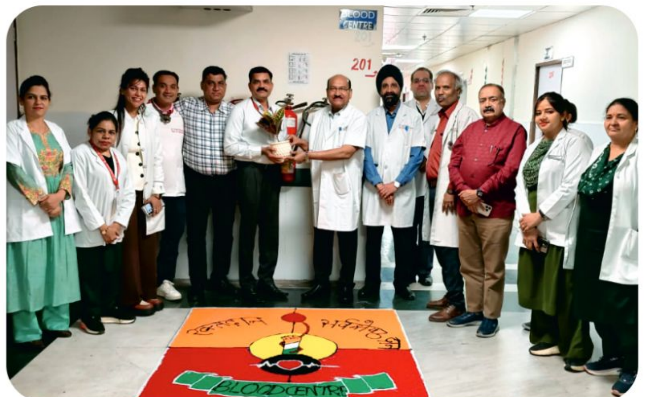
Lifeline at Trauma Centre Launched (24x7 Blood Storage Unit) on 24th March, 2026